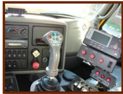
Operate snowplow and grader simulators!