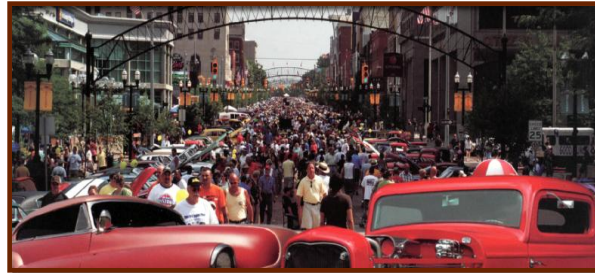
Back to the Bricks 2010