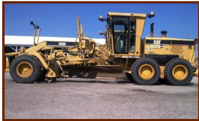
See a road grader without a steering wheel!