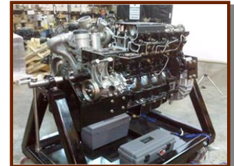
Check out a MaxxForce Powerplant!

A family-fun attraction celebrating the progress your Road Commission has made from horse-drawn beginnings to high-tech, high skilled partners in the community, serving Genesee County motorists for over 100 years!