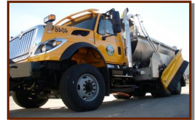
Climb aboard a Superduty snow plow!

All Back to the Bricks events are FREE! Visit www.backtothebricks.org for details