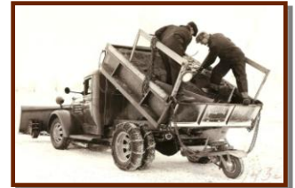
Vintage snow plow w/spreaders