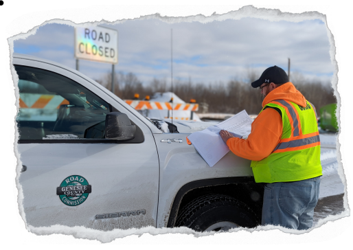
Drive safely in construction zones!

INJURE / KILL A WORKER $ 7500 + 15 YEARS