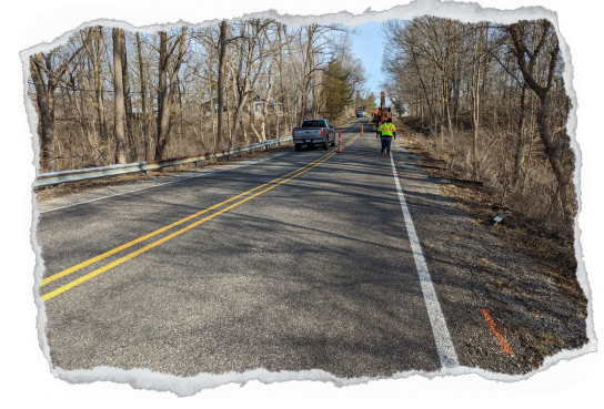
12 guardrail replacement projects throughout the county from March to May